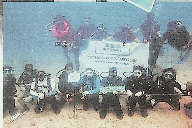
Nestlé Cares volunteers in a triumphant pose after their conservation activities in Mabul Island, Sabah and Perhentian Island, Terengganu.