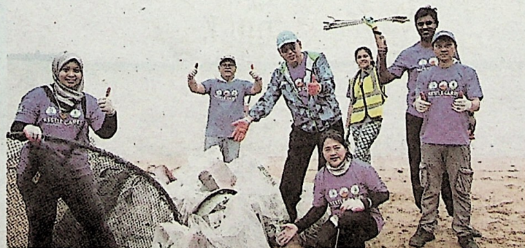
Beach clean-up across six locations.