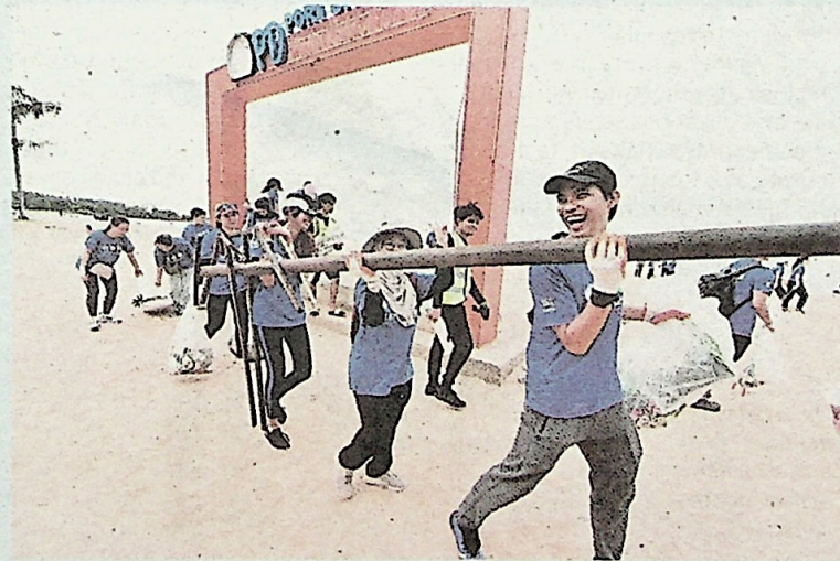
Volunteers making a positive impact.