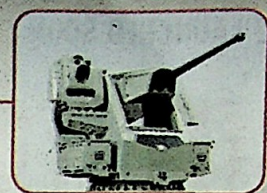
Aselsan SMASH 30mm Turkiye-made remote-controlled weapon system.