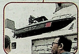
Fast interceptor craft.