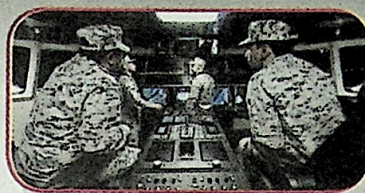
Integrated bridge and navigation system.