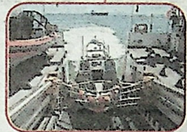
The stern launch area for rigid hull fender boats.