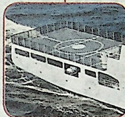
The ship's helicopter landing deck can accommodate MMEA's Leonardo AW139 or the Eurocopter (now Airbus Helicopters) AS365 N3 Dauphin helicopters.