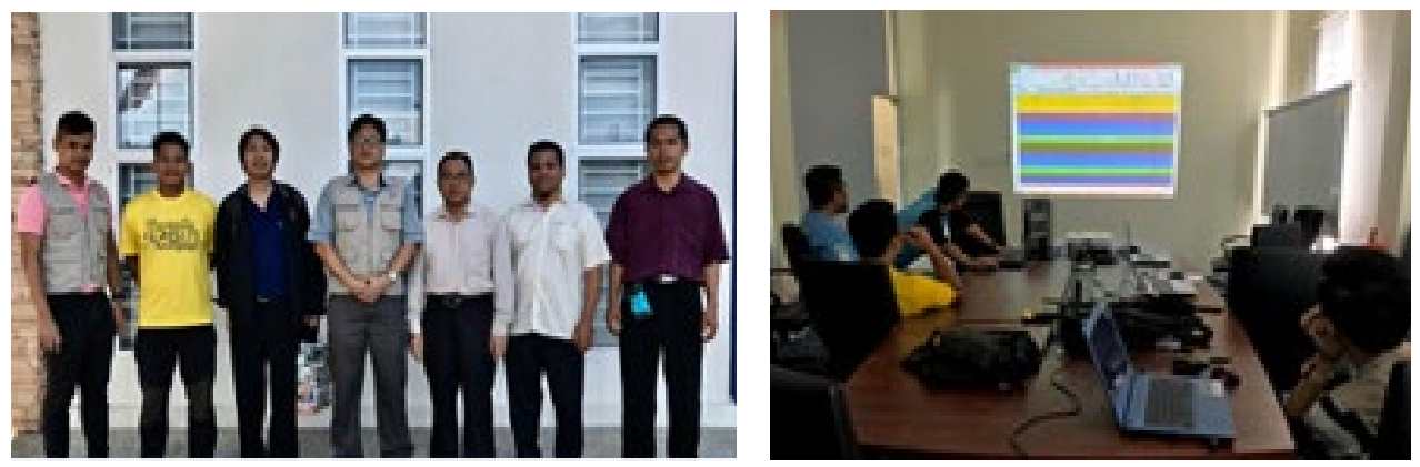
Photo 1: Workshop on data verification between MFRDMD and SEAFDEC TD officers, National and State Coordinators with local enumerators at Department of Fisheries Sabah Officers in Tawau (19-20 December 2019).