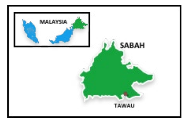
Figure 1: Location of Study Sites in the State of Sabah