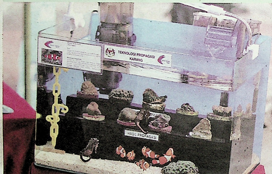
Coral propagation technology was also on display by the Department of Fisheries during the event.

The coastal town and Blue Lagoon perhaps needs no introduction as a visitor destination, but more dedicated efforts in promoting environmental awareness to protect its underwater treasures.