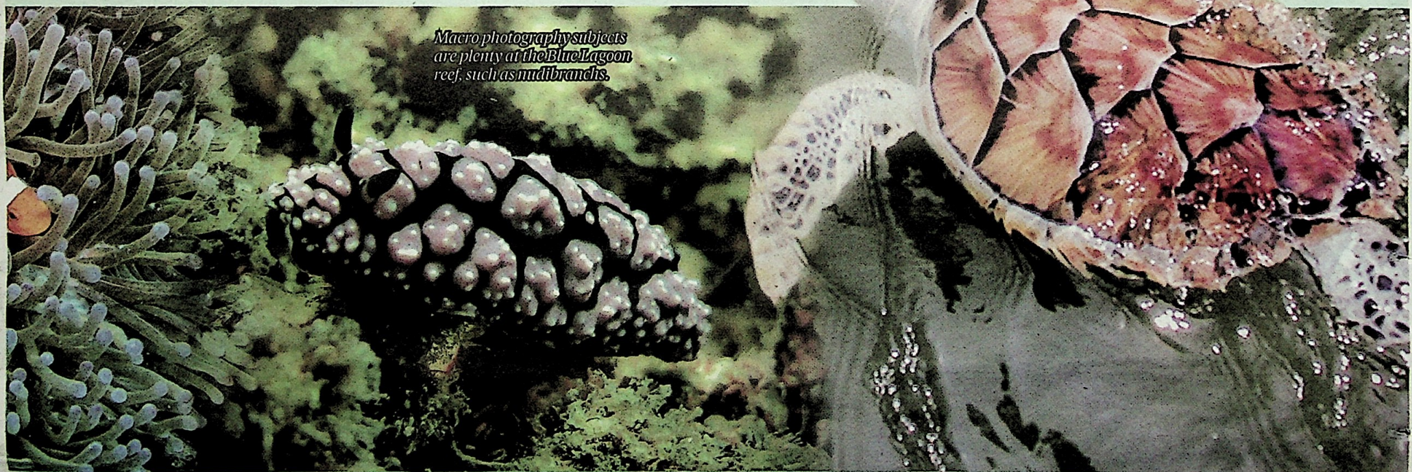
Macro photography subjects are plenty at the Blue Lagoon reef, such as mud branches.