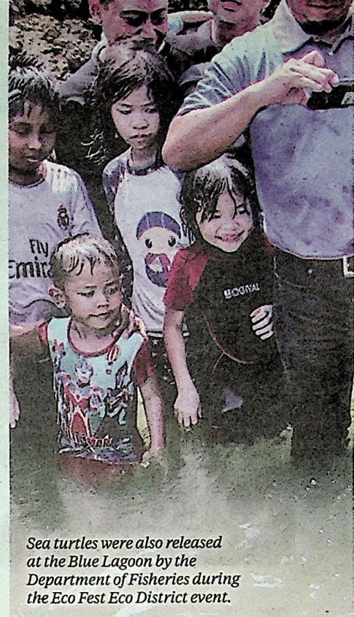
Sea turtles were also released at the Blue Lagoon by the Department of Fisheries during the Eco Fest Eco District event.

The boat ride to the dive spot of Blue Lagoon takes mere minutes and before I realise it, most of the other scuba divers are already in the water. Splintering into two groups, we descend to a depth of six