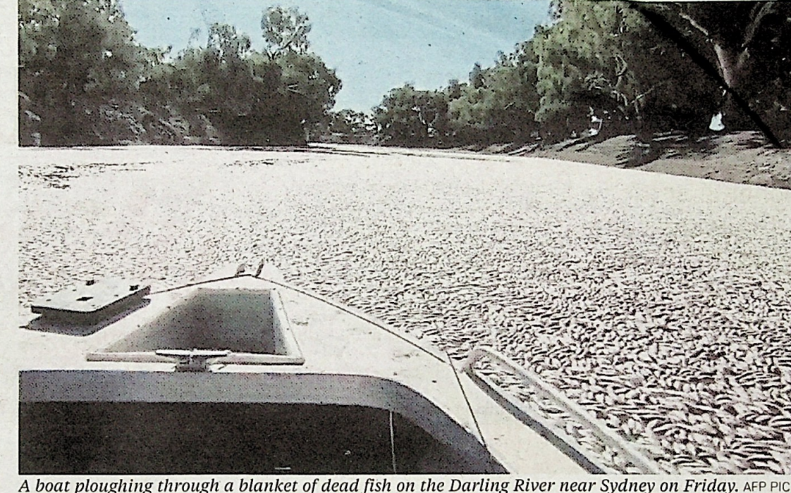
A boat plougning through a blanket of dead fish on the Darling River near Sydney on Friday. AFP

Menindee has a population of some 500 people and has been ravaged by both drought and flooding in recent years. AFP