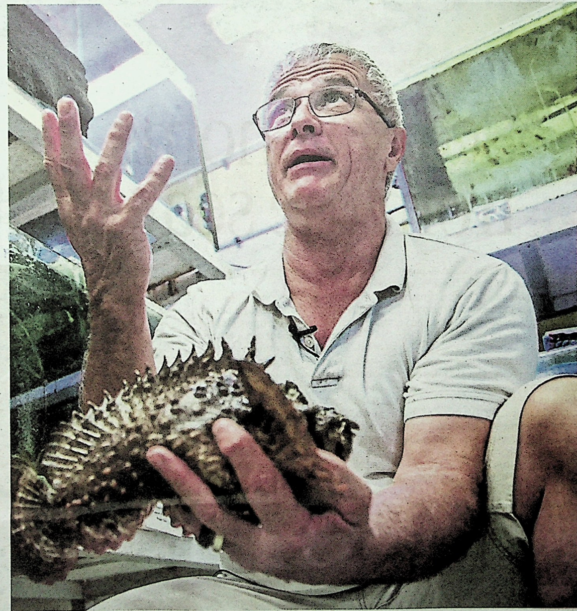
Seymour is among those who have survived the stonefish's sting.