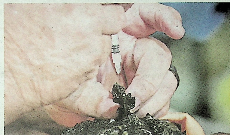
Venom being extracted from a stonefish.