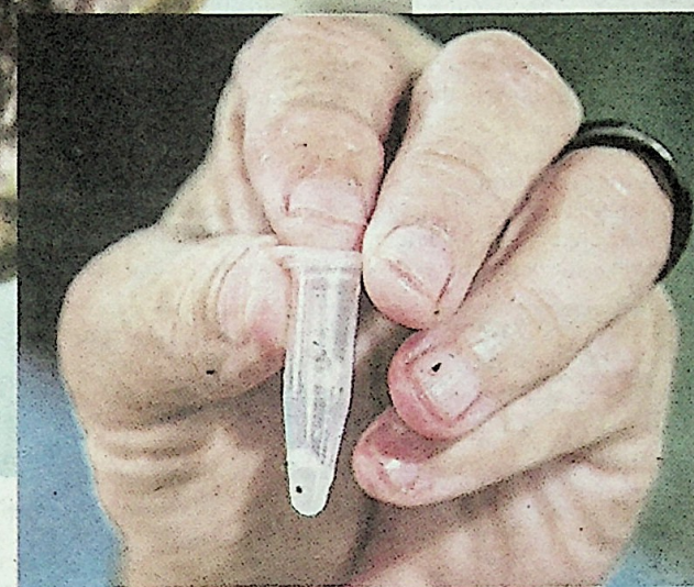
BELOW: This photo taken on April 8 shows Seymour holding a vial containing venom from a stonefish.