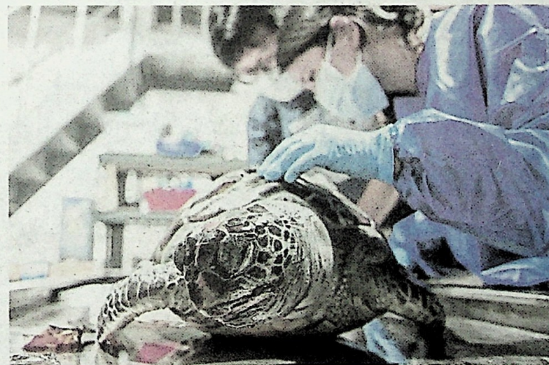
A dead sea turtle being dissected to determine the cause of death at the headquarters in New Taipei City.

explaining that coastal construction projects could "cause fishing vessels to abandon those areas" and move to new spots.