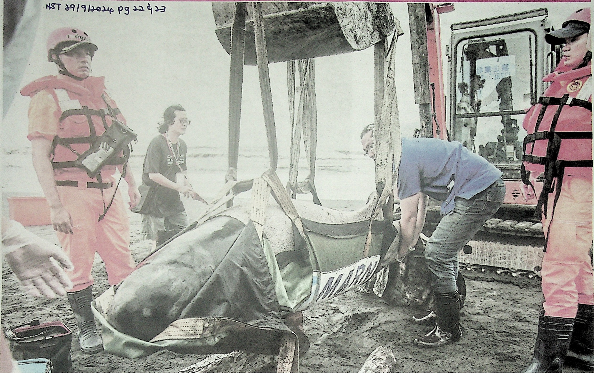
Volunteers from the Taiwan Cetacean Society (TCS) and Taiwanese coastguard officers working to move a stranded dwarf sperm whale on Zhuangwei beach in Yilan county.