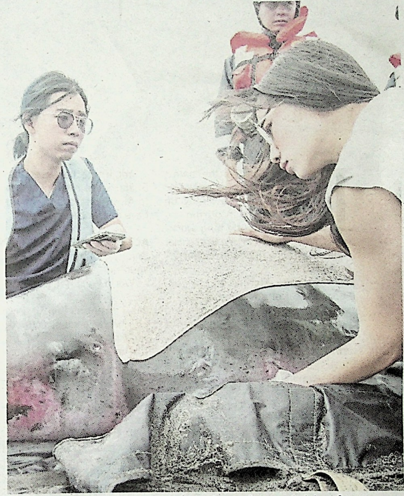
Volunteers helping to measure the heart beats of a stranded dwarf sperm whale on Zhuangwei beach in Yilan.