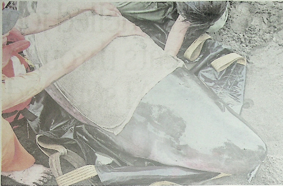
Covering a stranded dwarf sperm whale with a wet cloth to keep it moist.