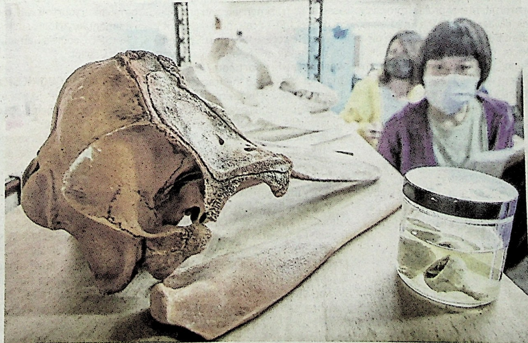
Whale bones on display at the headquarters of the Taiwan Cetacean Society.